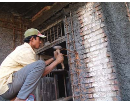
Mason involved in school retrofitting

The School Earthquake Safety Program (SESP) of NSET has been implemented with maximum participation of the central and local government institutions, school management committees, parents and the students. In the process, different means are incorporated to transfer the technology to community grass- root level. The whole execution of the project is designed as a tool for