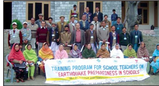
Participants of the Training on Earthquake Preparedness for school teachers in Pakistan

seismic retrofitting of existing school buildings in Gilgit and Northern areas of Pakistan by undertaking pilot demonstration program in each areas and conducting appropriate training for masons and school operators, b) to enhance earthquake awareness among the school system and institutionalize disaster preparedness and response planning, especially on seismic risks (on actions and measures to be taken before, during and after earthquakes, and development of safe school program, including check lists, evacuation drills, and so on, c) to undertake a comparative research of