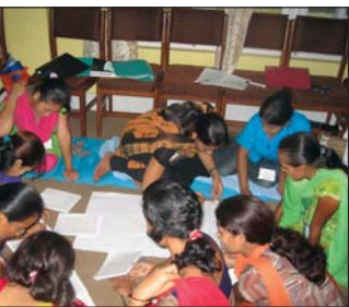
Participants involved in the training

Management Capacity Building for Municipalities were conducted during June 2007 for the participants from the 6 municipalities of CBDM project.