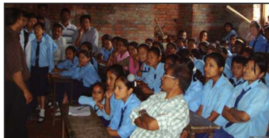
Attending the orientation lecture

July, 2007: NSET professional made presentation on "Earthquake Risk and its Preparedness" in the District level