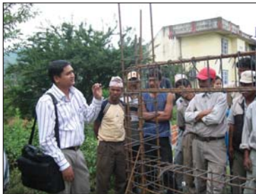
Briefing during practical exercise