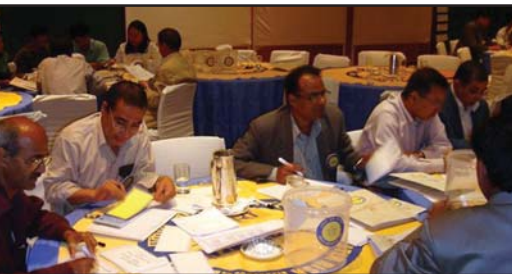
During the sectoral workshop