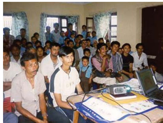
During the training

knowledge and skill are backed by practical real structures in school retrofitting and earthquake resistant new construction. Several tests are conducted to support the knowledge in relation to effect of placement of reinforcement rod in beam/slab, quality of work governed by material and workmanship like excess water effect, curing effect etc. Based on the