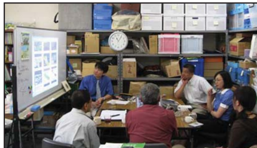
During the meeting held at Rescue Stock Yard office in Nagoya

Further in his stay he would participate and learn from the various activities of RSY, attend meetings, workshops and also attend Japan CASiFiCA