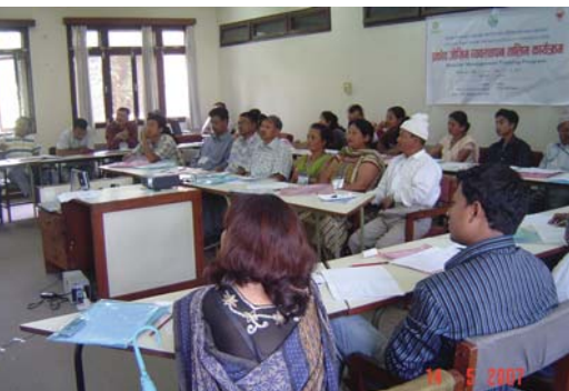
Participants during the DM training

Lalitpur Sub-Metropolitan City (LSMC) and NSET under the project CBDMP-K. Thirty volunteers representing the five different wards and the municipal officials participated in the training.