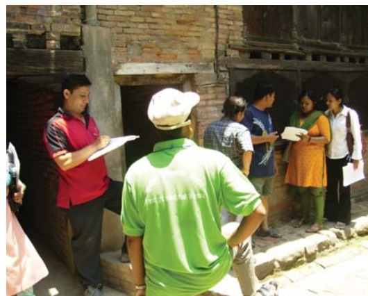
Observing the vulnerability during the field visit

The project: Community Based Disaster Management Program in Kathmandu Valley , was implemented by NSET with the financial support of Oxfam GB, Nepal. The program was implemented in the selected 5 wards (6, 8, 12, 18, and 20) of Lalitpur in close collaboration with the Lalitpur Sub Metropolitan City (LSMC). The main aim of the project was to enhance the security of vulnerable communities through appropriate capacity building measures (awareness campaigns, trainings) and institutionalization of the process in the local governance system to guaranty the sustainability of such projects. The overall objective of the project was the formation of Ward-Level Disaster Risk Management Committee (WDMC) in selected five wards of Lalitpur Sub-Metropolitan City and the capacity enhancement of WDMC and volunteers to design and implement disaster risk reduction and preparedness activities. And its specific objectives were – capacity building in communities and institutions to design and implement disaster risk reduction strategies and preparedness activities; enhancement of capability of municipal staffs/ward DMC members/volunteers and representatives concerning disaster risk reduction,