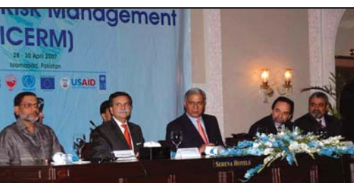
Rt Honorable PM of Pakistan and Mr. Dixit with other dignitaries at the conference

An International Conference on Earthquake Risk Management (ICERM) was organized during 28 – 30 April 2007 in Islamabad, Pakistan. ICERM was organized jointly by Earthquake Reconstruction and Rehabilitation Authority (ERRA) of